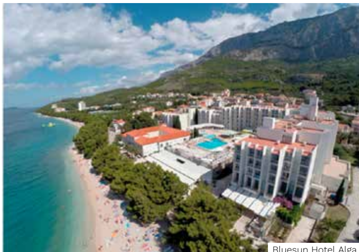
Bluesun Hotel Alga

This extension takes place after your main tour.