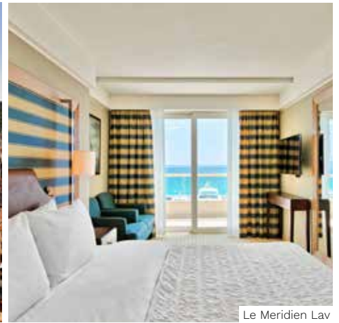
Le Meridien Lav