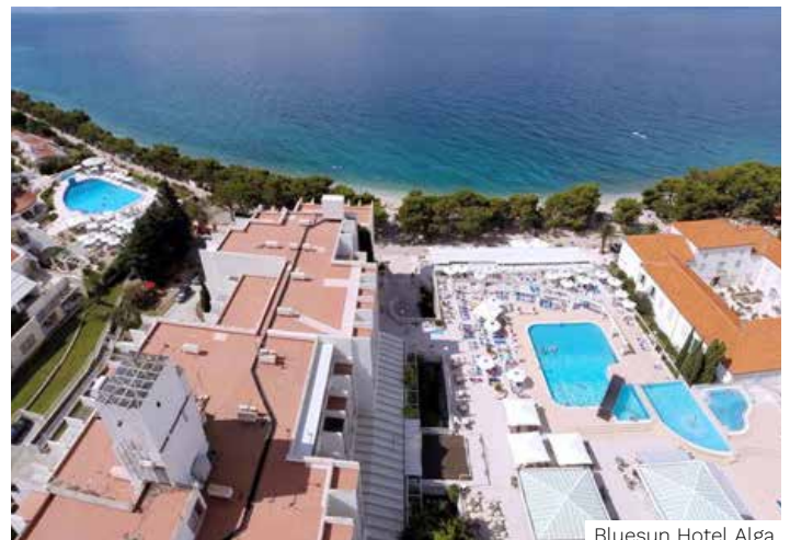
Bluesun Hotel Alga