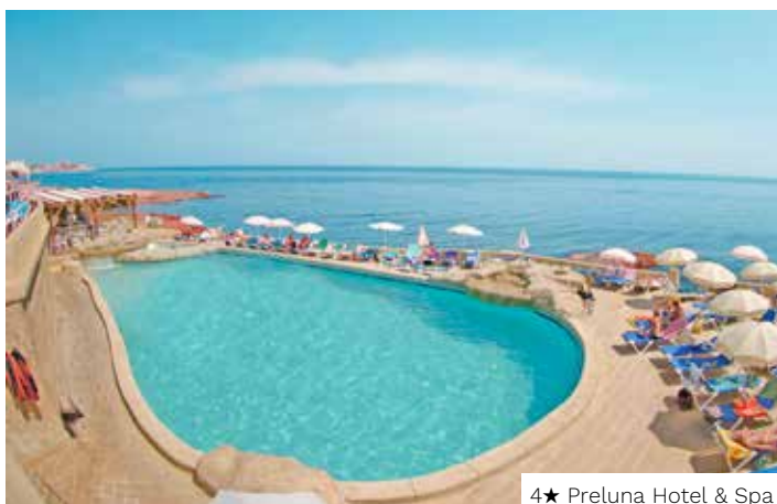
4★ Preluna Hotel & Spa

Your stay in Qawra is not escorted by a tour guide and your time will be free to explore the area at your own pace. Transfers are included.