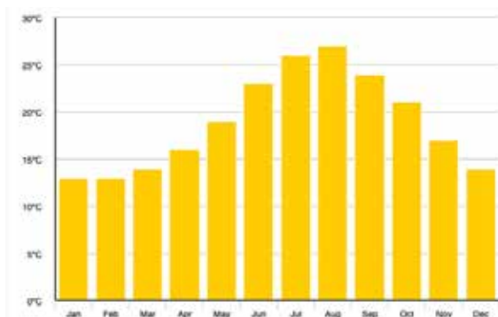
Average temperature: Valletta