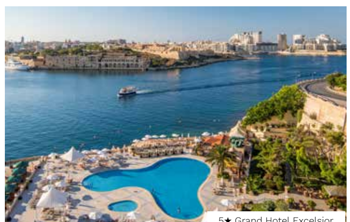
5★ Grand Hotel Excelsior